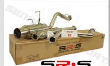
HONDA CIVIC 2/4DR EX 92-00 MODEL NUMBER : SRS-CBEX-HC9200