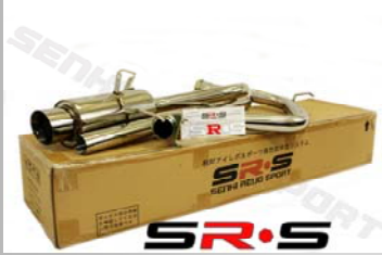
CHRYSLER PT CRUISER 9906 MODEL NUMBER : SRS-CBEX-CPT9906