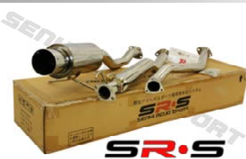
HONDA CIVIC EX 01-05 MODEL NUMBER : SRS-CBEX-HC00105