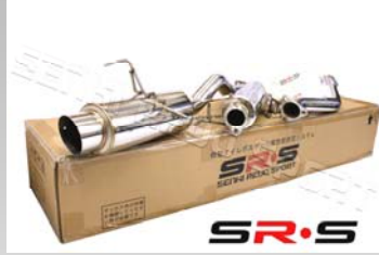
ACURA RSX NON TYPE S 02-06 MODEL NUMBER : SRS-CBEX-ARNS0206