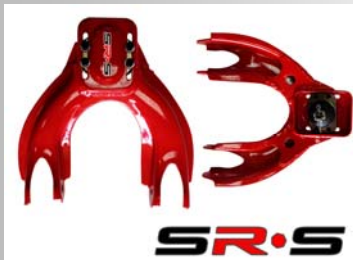
94-01 ACURA INTEGRA FRONT CAMBER KIT MODEL NUMBER : SRS-CAMBER-INTEGRA9401

PLEASE CHECK OUR WEBSITE FOR FUTURE MODELS ADDED TO OR LINE UP