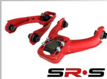
96-00 HONDA CIVIC FRONT CAMBER KIT MODEL NUMBER : SRS-CAMBER-CIVIC9600