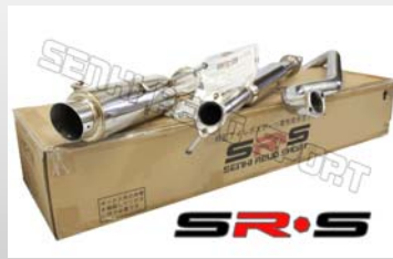
NISSAN ALTIMA 93-97 MODEL NUMBER : SRS-CBEX-NALT9397