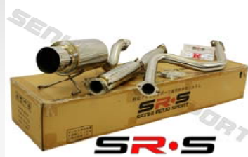
HONDA CIVIC 3DR VX 92-95 MODEL NUMBER : SRS-CBEX-HC9295VX