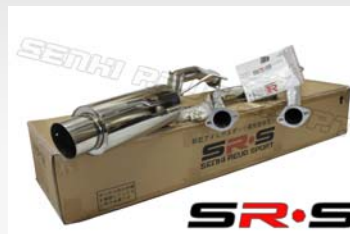
MITSUBISHI LANCER ES 02-06 MODEL NUMBER : SRS-CBEX-MES0203