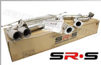
VOLKSWAGEN GOLF V GTI MK5 06-08 MODEL NUMBER : SRS-CBEX-VWG0608