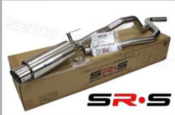
CHEVROLET CAVALIER 95-01 MODEL NUMBER : SRS-CBEX-CC9501