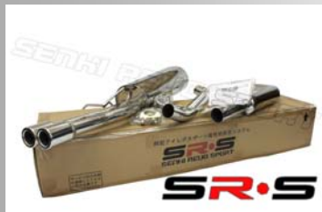
VOLKSWAGEN JETTA 1.8T 03-05 MODEL NUMBER : SRS-CBEX-VWJ0305