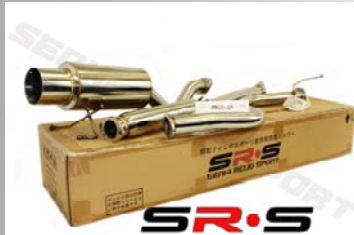
HONDA CIVIC 3DR CX/DX 96-00 MODEL NUMBER : SRS-CBEX-HCHB9600