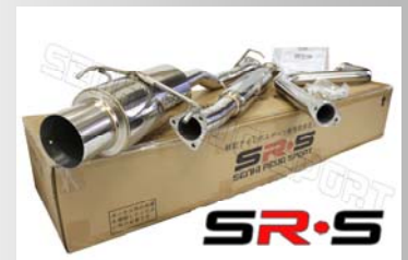
HONDA PRELUDE NON-SH 97-01 MODEL NUMBER : SRS-CBEX-HP9701NSH