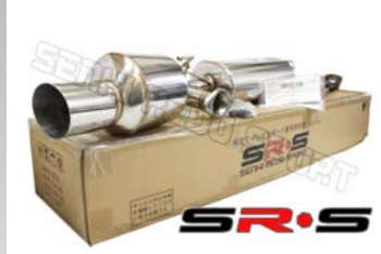
TOYOTA CELICA GTS 00-05 MODEL NUMBER : SRS-CBEX-TCEL0005