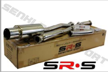
HONDA ACCORD 90-93 MODEL NUMBER : SRS-CBEX-HA9093