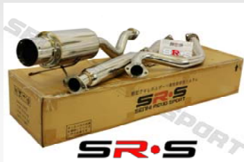
ACURA INTEGRA 2D GSR 00-01 MODEL NUMBER : SRS-CBEX-AIGSR0001