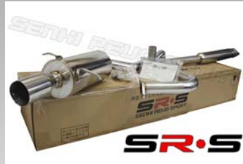
CHEVROLET COBALT 2.2L 05-10 MODEL NUMBER : SRS-CBEX-CC0507