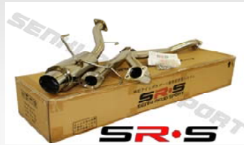
NISSAN SENTRA SPEC V 02-05 MODEL NUMBER : SRS-CBEX-NS0205