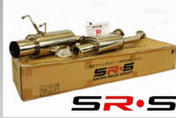
NISSAN 240sx S13 2.5" WITH RESONATOR 89-94 MODEL NUMBER : SRS-CBEX-NS138994RS