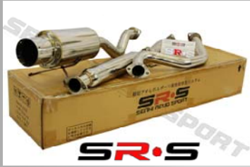
ACURA INTEGRA 2D GS 94-01 MODEL NUMBER : SRS-CBEX-AIGS9401