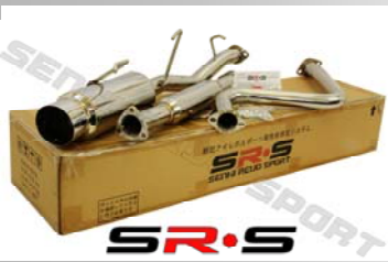
HONDA PRELUDE SI 92-96 MODEL NUMBER : SRS-CBEX-HP9296