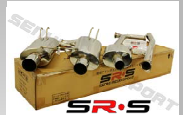
ACURA TSX TYPE RE 04-08 MODEL NUMBER : SRS-CBEX-ACUTSX0408