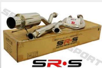
ACURA INTEGRA 4D GSR 00-01 MODEL NUMBER : SRS-CBEX-AIGSR00014D