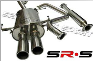
NISSAN MAXIMA 00-03 TYPE RE MODEL NUMBER : SRS-CBEX-NMRE0003