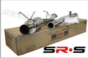
NISSAN 240sx S13 3" 89-94 MODEL NUMBER : SRS-CBEX-NS138994