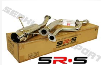
NISSAN MAXIMA 96-99 MODEL NUMBER : SRS-CBEX-NM9699