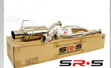
HONDA FIT 06-08 MODEL NUMBER : SRS-CBEX-HONFIT