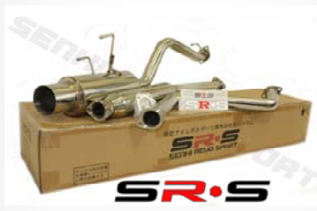
HONDA CIVIC SI 99-00 MODEL NUMBER : SRS-CBEX-HC9900SI