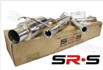
HONDA PRELUDE SH 97-01 MODEL NUMBER : SRS-CBEX-HP9701SH