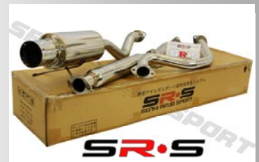
ACURA INTEGRA 4D LS 94-01 MODEL NUMBER : SRS-CBEX-AILS94014D