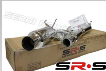
MITSUBISHI ECLIPSE GSX 95-99 MODEL NUMBER : SRS-CBEX-MEX9599