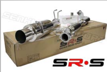
MITSUBISHI ECLIPSE GSX/TALON 89-94 MODEL NUMBER : SRS-CBEX-MEX8994