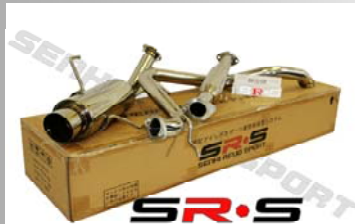
NISSAN SENTRA 95-99 MODEL NUMBER : SRS-CBEX-NS9599