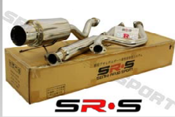
ACURA INTEGRA 2D RS 94-01 MODEL NUMBER : SRS-CBEX-AIRS9401