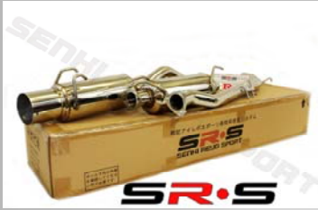
HONDA CIVIC SI 2DR 06-11 MODEL NUMBER : SRS-CBEX-HCHB9600