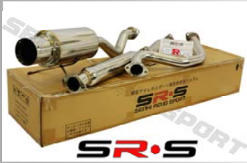
ACURA INTEGRA 2D GSR 94-99 MODEL NUMBER : SRS-CBEX-AIGSR9499