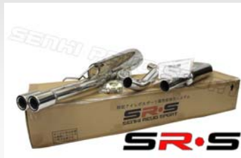
VOLKSWAGEN JETTA 1.8T 99-02 MODEL NUMBER : SRS-CBEX-VWJ9902