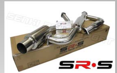
MITSUBISHI ECLIPSE GST/ TALON 95-99 MODEL NUMBER : SRS-CBEX-MET9599