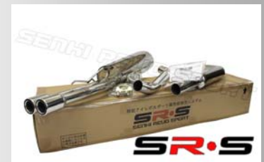
VOLKSWAGEN JETTA 2.0 99-02 MODEL NUMBER : SRS-CBEX-VWJ9902