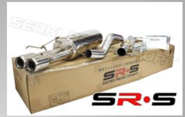
VOLKSWAGEN GOLF GTI 03-05 MODEL NUMBER : SRS-CBEX-VWG0305