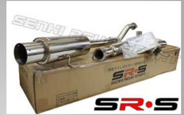
CHEVROLET COBALT SS SUPERCHARGED 05-08 MODEL NUMBER : SRS-CBEX-CCSS0508