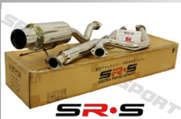
ACURA INTEGRA 4D GSR 94-99 MODEL NUMBER : SRS-CBEX-AIGSR9499 4D