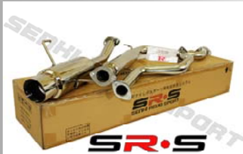
NISSAN MAXIMA 95-96 MODEL NUMBER : SRS-CBEX-NM9596