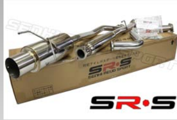
HONDA ACCORD 4CYL 94-97 MODEL NUMBER : SRS-CBEX-HA9497