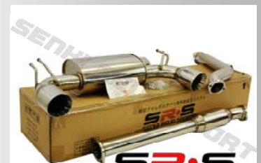
MITSUBISHI EVO X TYPE-RE 08-12 MODEL NUMBER : SRS-CBEX-EVOXRE