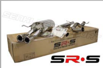
VOLKSWAGEN BEETLE 99-01 MODEL NUMBER : SRS-CBEX-VWB9901