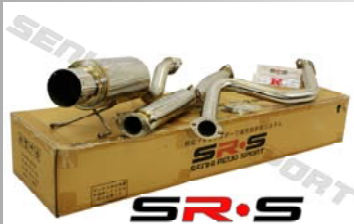
HONDA CIVIC 3DR DX/SI 92-95 MODEL NUMBER : SRS-CBEX-HC9295