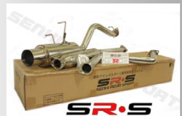
HONDA CIVIC LX/DX 2/4DR 96-00 MODEL NUMBER : SRS-CBEX-HC9600LXDX