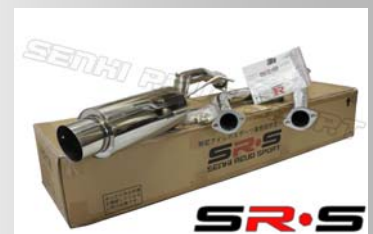
MITSUBISHI LANCER LS 02-06 MODEL NUMBER : SRS-CBEX-MLS0203