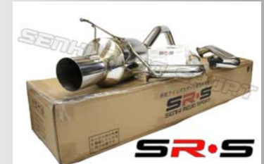
NISSAN MAXIMA 00-03 MODEL NUMBER : SRS-CBEX-NMAX0003