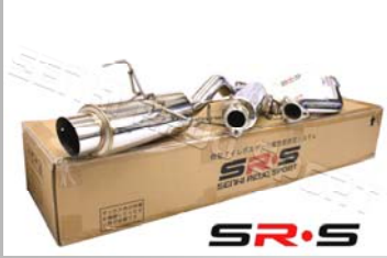
ACURA RSX TYPE S 02-06 MODEL NUMBER : SRS-CBEX-ARS0206