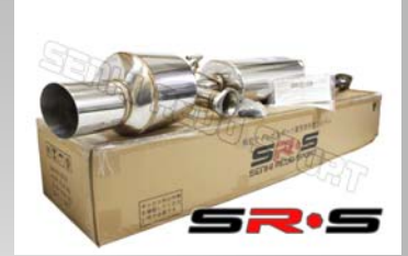
TOYOTA COROLLA 93-97 MODEL NUMBER : SRS-CBEX-TCOR9397