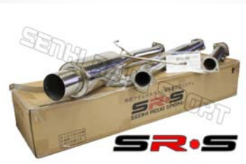
MITSUBISHI LANCER EVO 8/9 03-06 MODEL NUMBER : SRS-CBEX-ME0306