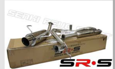
NISSAN 200sx 2.0L 95-99 MODEL NUMBER : SRS-CBEX-NS9599