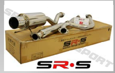
ACURA INTEGRA 2D LS 94-01 MODEL NUMBER : SRS-CBEX-AILS9401