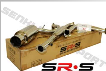
MITSUBISHI ECLIPSE GS/ RS 95-99 MODEL NUMBER : SRS-CBEX-6816