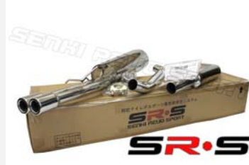
VOLKSWAGEN JETTA 2.0 03-05 MODEL NUMBER : SRS-CBEX-VWJ0305