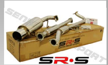
HONDA ACCORD 4CYL 98-02 MODEL NUMBER : SRS-CBEX-HA9802