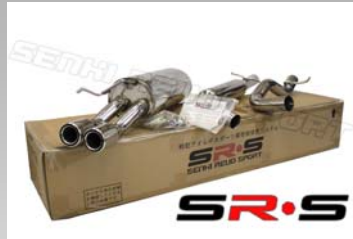
VOLKSWAGEN GOLF IV 1.8T 99-01 MODEL NUMBER : SRS-CBEX-VWG9901