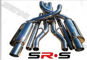
CHRYSLER 300C SRT8 6.1L V8 05-10 MODEL NUMBER : SRS-CBEX-C300C0510