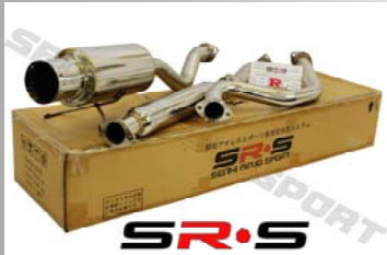
ACURA INTEGRA 4D GS 94-01 MODEL NUMBER : SRS-CBEX-AIGS94014D