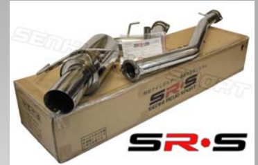
NISSAN 240sx S14 95-98 MODEL NUMBER : SRS-CBEX-NS149498