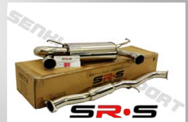
NISSAN 350z 02-07 MODEL NUMBER : SRS-CBEX-N350Z0207