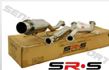
HONDA CIVIC LX / DX 01-05 MODEL NUMBER : SRS-CBEX-HC00105DXLX