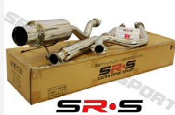
ACURA INTEGRA 4D RS 94-01 MODEL NUMBER : SRS-CBEX-AIRS94014D