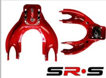
92-95 HONDA CIVIC FRONT CAMBER KIT MODEL NUMBER : SRS-CAMBER-CIVIC9295